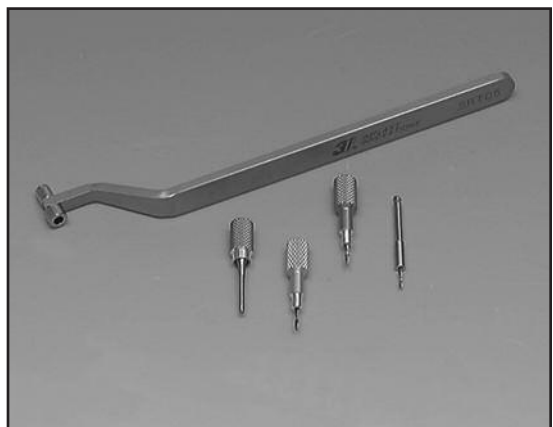
Screw Removing Instrument Kit SRT10

Illustrations are representative and not to scale.